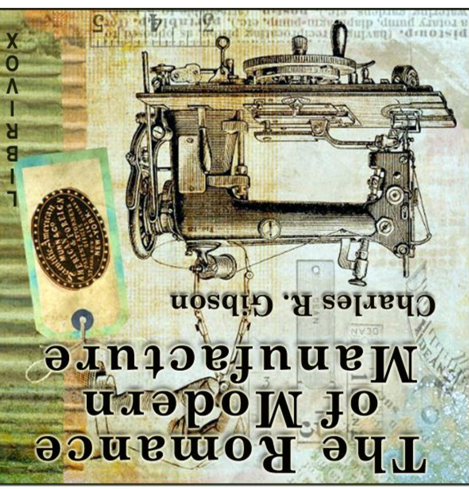
Cover image: Illustration, Sewing Vintage Machine by Pixabay member ArtsyBee Cover design for Librivox by Michele Fry

Run Time: 08:21:07 Zip FileSize: 235 MB Catalog Date: 2023-07-04